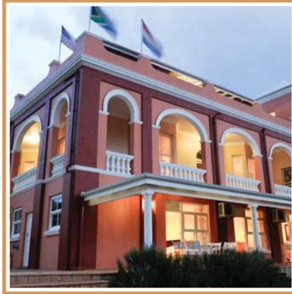
Sica's THE LOFT