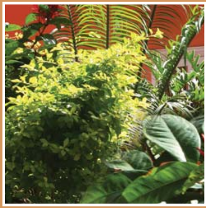
Sica's GUEST HOUSE