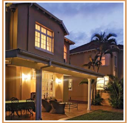
Sica's MUSGRAVE B&B